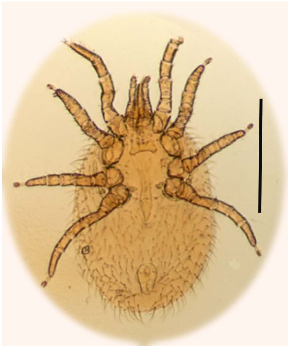
FIGURE 1: Habitus of Ophionyssus natricis female, collected from Boa constrictor terrarium. Scale bar = 0.35 mm.

over Boa constrictor and its terrarium, estimating that there were approximately 4000 individuals, estimation based on three subsamples of 2 ml each (Table 1). Most specimens were immature stages and adults (females) (Figure 1). Empty puparia of Phoridae flies and some individuals of Glycycometus malaysiensis (Fain and Nadchatram, 1980) (Aeroglyphidae) were also present in this sample.