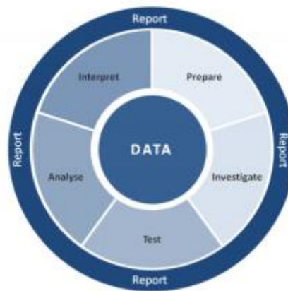
Figure 3: The data journey transformed by Child et al. [17]

Previously, the data journey believed to be flat but nowadays it should be round (as in figure 3) and ingoing which available throughout the life of project and lead to the effective interpretation of ground conditions and characterization of the site [17]. Child et al. [17] continued to explained that visualizations being generated by tools and ended in the form of a digital archive.