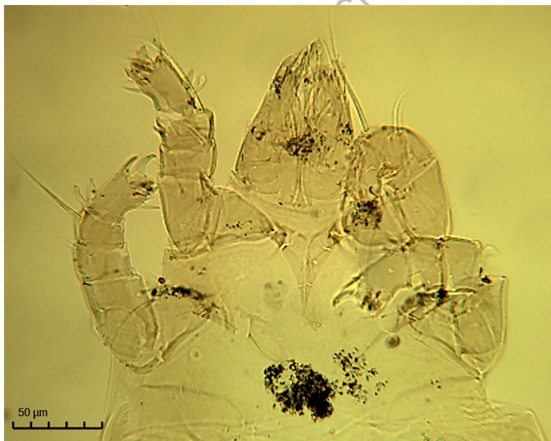
Figure 2. Rhizoglyphus howensis Manson (adult female), from this study. Ventral view of Gnathosoma (mouth parts showing the robust base and the translucent tips of the chelicera) and Propodosoma (1st two pair of walking legs).